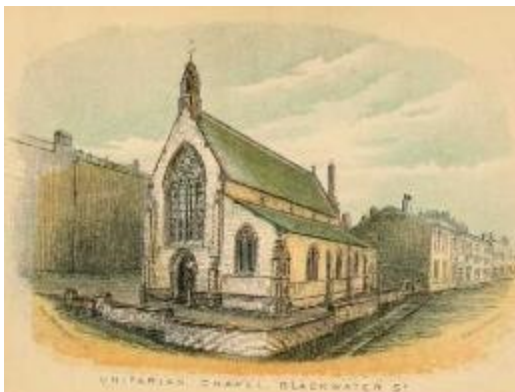
Drawing of Blackwater Street Chapel from Rochdale Past and Present © William Robertson