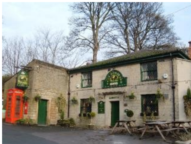
The Packhorse Inn, Birtle.

I did mention in the December Messenger that we would try to arrange a walk between Christmas and New Year. If the weather is fine on Friday 28th December we're going to do the Birtle walk from the Pack Horse. Please meet in the pub car park at 10.30 am if you would like to come. Bring a snack as the walk will probably be a couple of hours – or we could have soup and a roll at the Pack Horse.