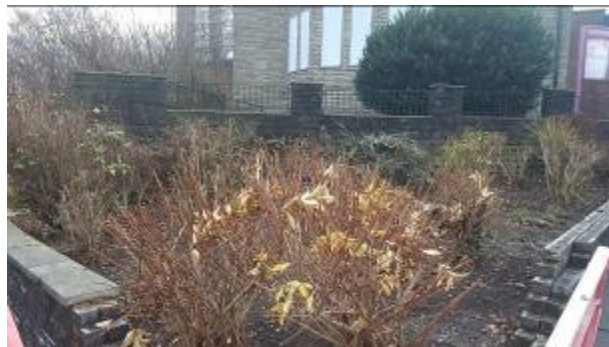
The tidy-up work in progress at the front of Clover Street Church.