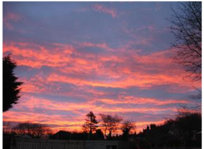
SUNRISE OVER NORDEN VIEW - 7.00 am, Tuesday, 23 February

Writing in a book entitled Handbook for the Soul , there appears this quote at the start of a chapter by Stephen R Covey - "I think that the most significant work we ever do in our whole life - in our whole world - is done within the four walls of the home. All mothers and fathers, whatever their station in life, can make the most significant of contributions by imprinting the spirit of service on the souls of their children, so that those children grow up committed to making a difference."