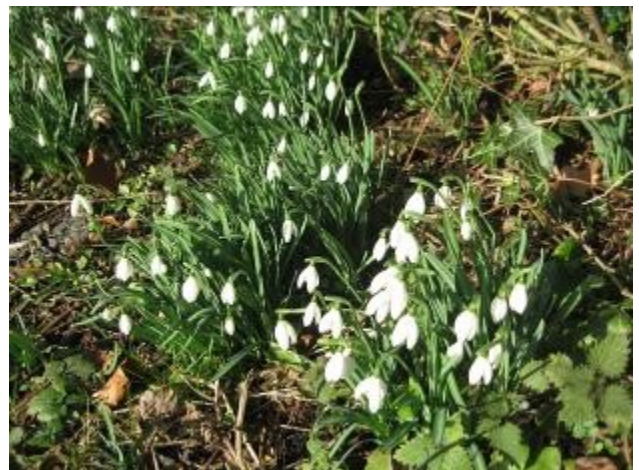
Snow-drops from Joyce's garden! New life, new hope.