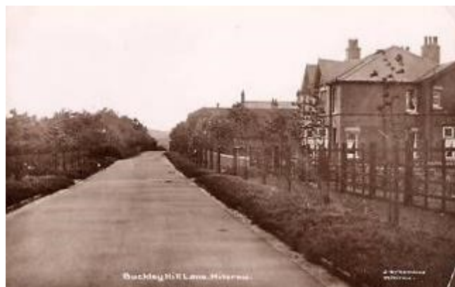
Buckley Hill Lane in days gone by ...

Disappointingly our walk between Christmas and Year had to be cut short due to poor weather so we only completed half the figure of eight at Birtle. As this edition of the Messenger was going to press we were due to walk round the edge of Kingsway Business Park from Buckley Hill Lane, Milnrow with refreshments half way round at the Spring Inn, Broad Lane. Due to various Church commitments and holidays the next walk will be on 2nd March when we will be having a local walk around the Greenbooth and Naden reservoirs.